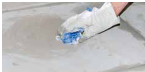
Removes grout haze