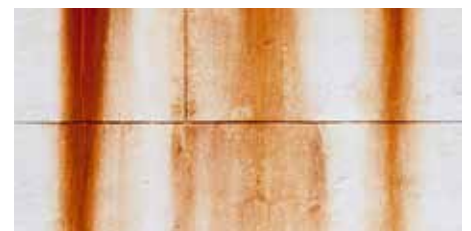
Removes rust stains