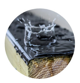
Completely protects and seals your new or existing timber deck frame. Protected from water/moisture rot and frame weathering.