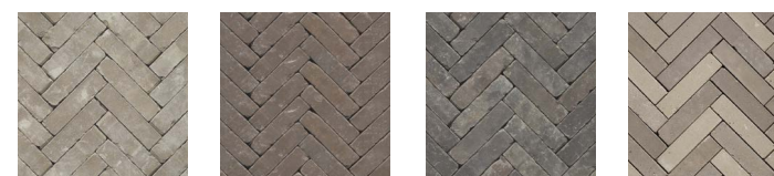
Ash Silver Birch Dove Mallow