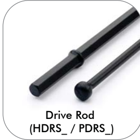
Drive Rod (HDRS_ / PDRS_)