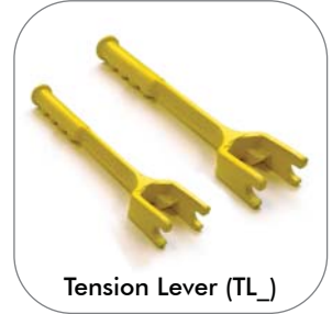
Tension Lever (TL_)