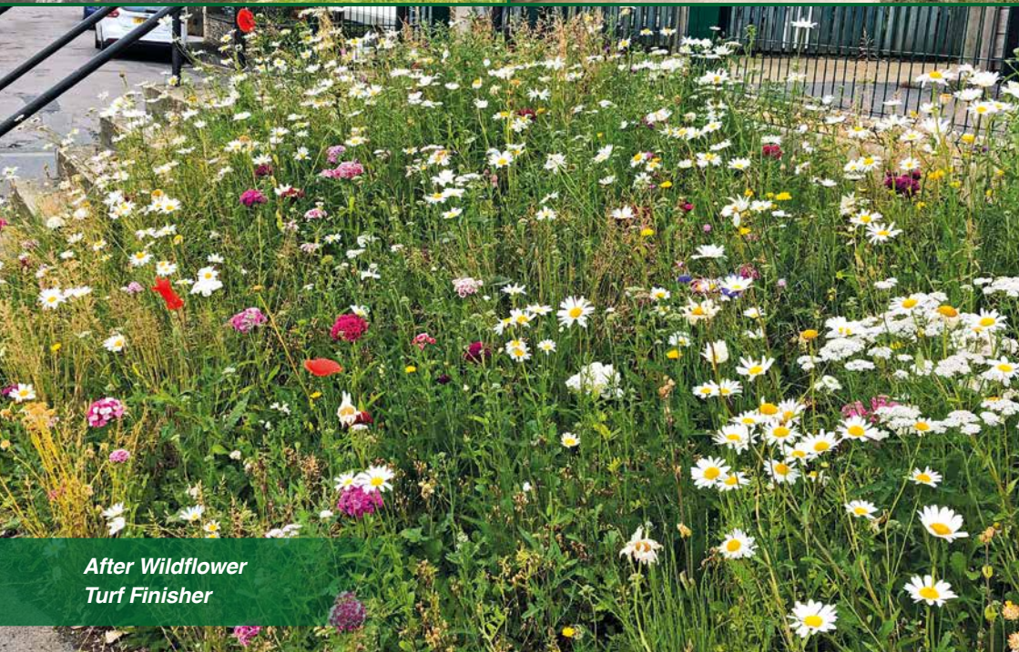
After Wildflower Turf Finisher